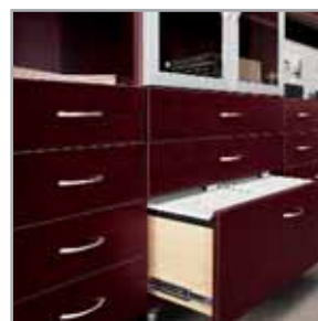
Hanging file drawers can accommodate letter and legal size filing